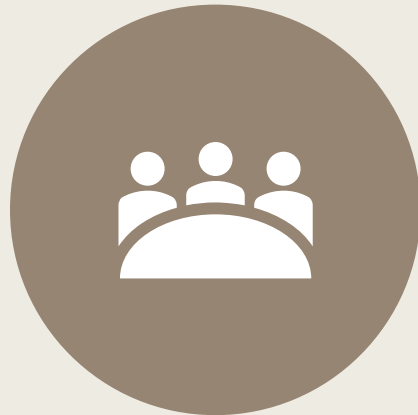
FACULTY ORGANISED PROJECTS